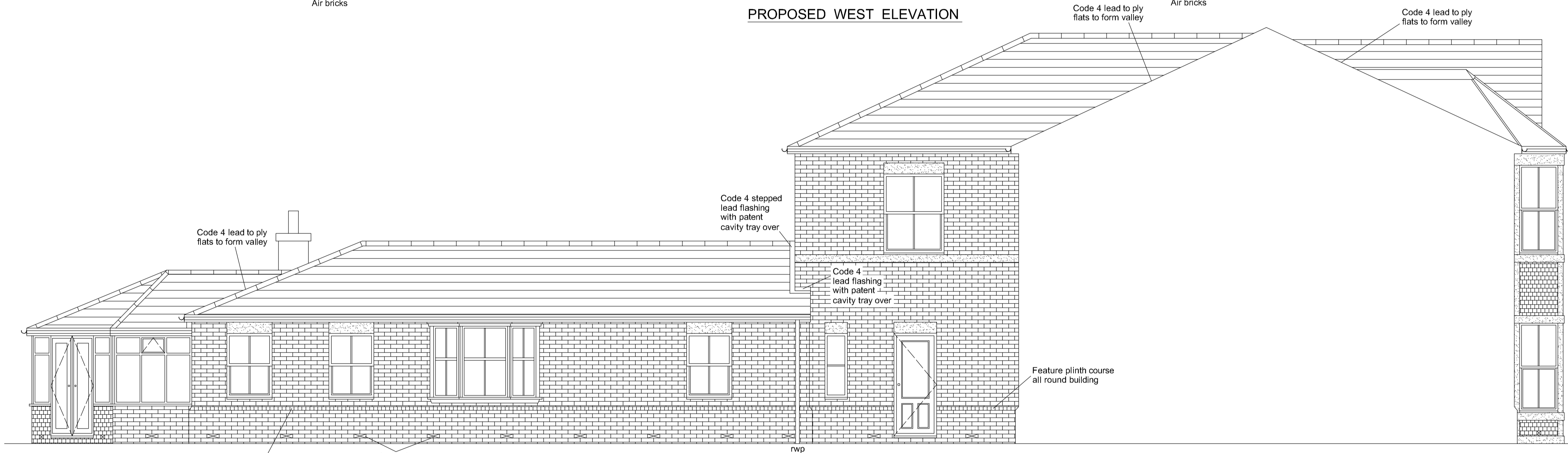
PROPOSED PART WEST ELEVATION